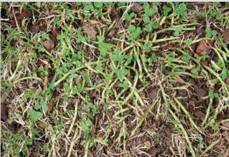
Both Durana and Patriot feature high numbers of stolons. This growth habit helps Durana & Patriot better withstand grazing pressure and weather stress.

For many on-farm situations and uses, Patriot or Durana can be used interchangeably with satisfactory results. However, the general recommendation is to use Patriot in high quality and intensively managed pastures with companion forages such as MaxQ tall fescue, orchardgrass, perennial ryegrass, prairie grass, etc. Because it was developed from wild clover ecotypes surviving harsh growing conditions and because it is lower growing with a denser mat of stolons, Durana is considered to be more aggressive and competitive in challenging environments (poorer, lower fertility and droughty soils). Therefore, it is recommended for use in cool season pastures with marginal soils and as a companion pasture forage with lower quality warm season grasses such as bermuda, bahia, etc.