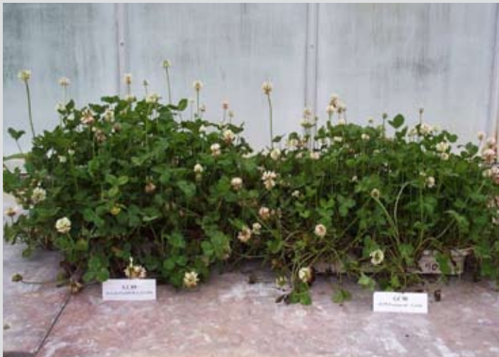
Because it is 50% ladino type, Patriot (L) has slightly larger leaves and is more upright in growth than Durana (R).

Durana is a medium-leaved intermediate white clover that was developed from naturally occurring ecotypes of white clover growing and surviving as volunteer plants in pastures in northern Georgia. Patriot was developed by crossing parent material from Durana with a Mississippi USDA population of virus-resistant ladino clover.